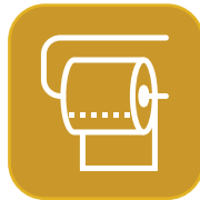
Sanitary Supplies (toilet paper, diapers, wipes, paper towels)