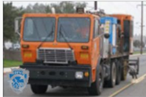
County Maintained Road System