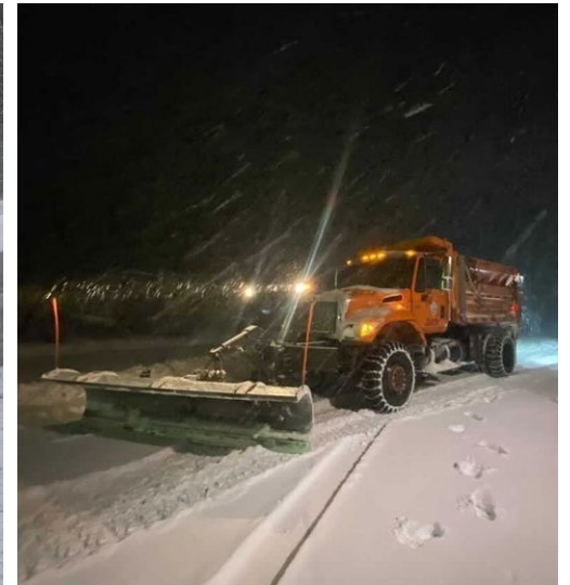
Dump trucks (18 to 24 inches snow maximum)