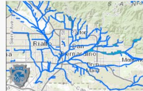
Flood Control Facilities