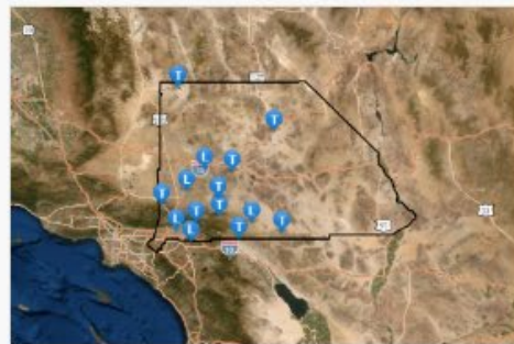
SWMD Waste Disposal Sites