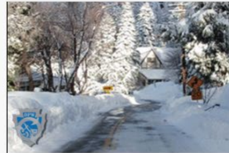
County Snow Removal Roads