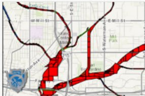
Flood Control Right of Way