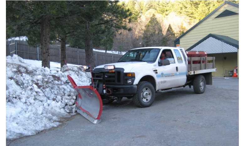
Plow trucks (18 to 24 inches snow maximum)