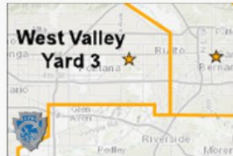
Transportation Road Yards Map