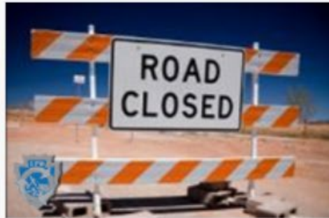
County Closed Road map

GIS Maps Published by the County of San Bernardino Department of Public Works